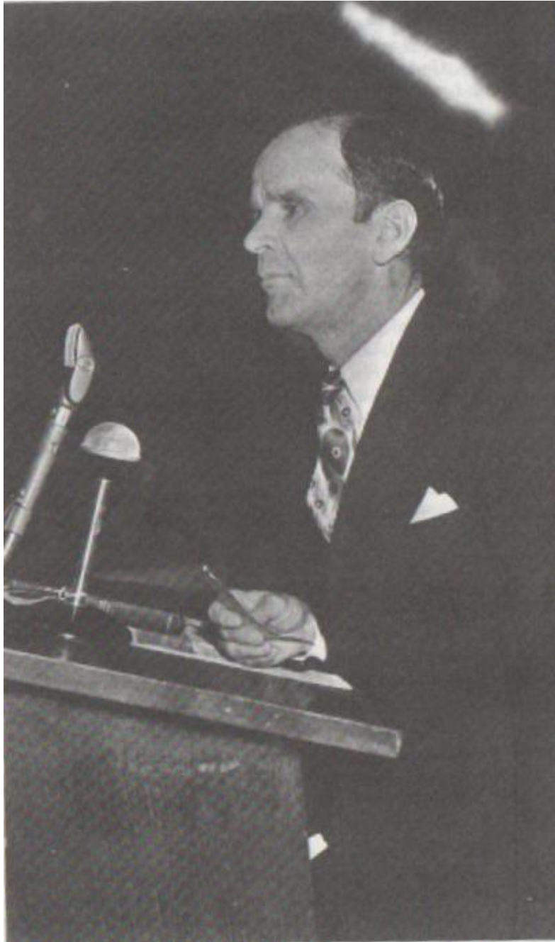
Figure 2: Rev. Branham's Picture with a halo of light above his head photographed at Sam Houston U.S.A in January 1950 (referred in text on page 37)