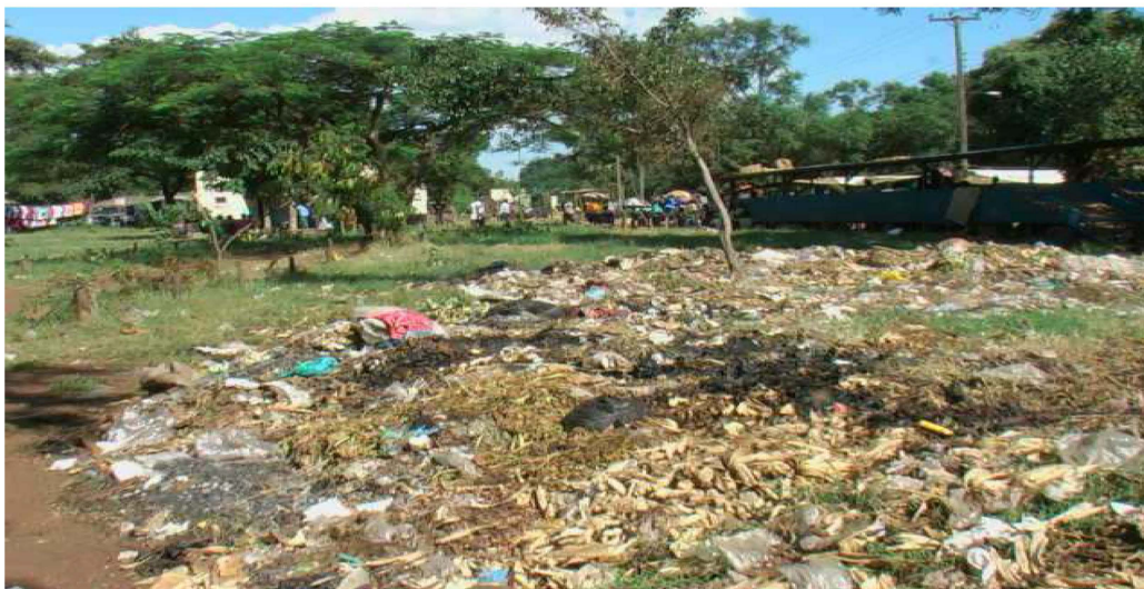
FIGURE 4: DUMPING SITE AT MARKET PARK

There were no signs of positive educational or environmental activities in Maendeleo, Taifa, Market and Jamhuri Parks despite there being a lot of potentials for these activities. There are several educational Institutions within Kisumu Town which could use the great educational resource potentials of urban Parks. Apparently this resource had not been well utilized or given due attention by these institutions. This was evident by the poor environmental conditions of most of the Parks. Learning institutions within the peripheries of the parks can contribute a lot in terms of dissemination of knowledge as well as maintenance of the Parks, but there was no evidence that they were involved with the parks. Due to the environmental condition of most of the urban parks, the environmental conservation benefits were greatly missed out. This was evident by the presence of litter and use of some Parks as dumping sites. Evident in Taifa, Market and Maendeleo Parks were plenty of litter and dumping sites within the Parks as seen in figure 4.