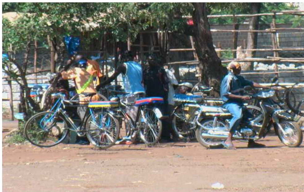
FIGURE 3: BICYCLE AND MOTORBIKE REPAIR STATION AT MAENDELEO PARK

refreshments within its periphery. There were no notable economic activities in Jamhuri Park. Central Park is the smallest among all the Parks and it seemed not to have opportunities for much economic activities due to its size and being located at the heart of Kisumu Town it was seen more as an artistic Park.