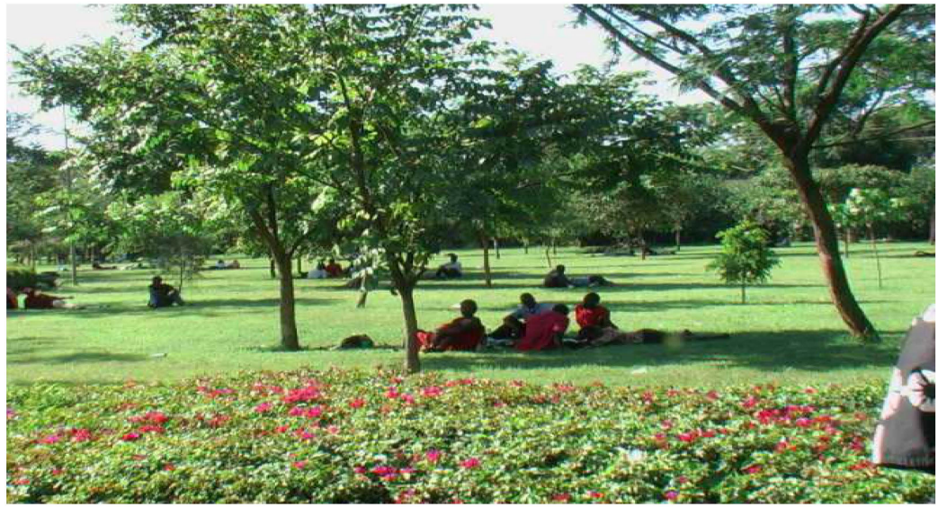
FIGURE 5: PARK USERS RELAXING IN A WELL-MAINTAINED AND ATTRACTIVE JKG

more trees were being grown to improve the environment. JKG had well maintained vegetation and provided plenty of shades for its many users as shown in figure 5. Jamhuri Park although poorly maintained was quiet rich in vegetation. Generally, the parks were underutilized as an environmental resource and as an informational tool that could be useful in dissemination of information to the public through avenues like historical structures, demonstration sites, notice boards, bulletin boards and suggestion boxes.